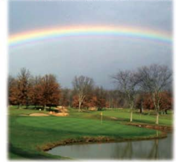
215 Rt 981 • Belle Vernon PA 15012